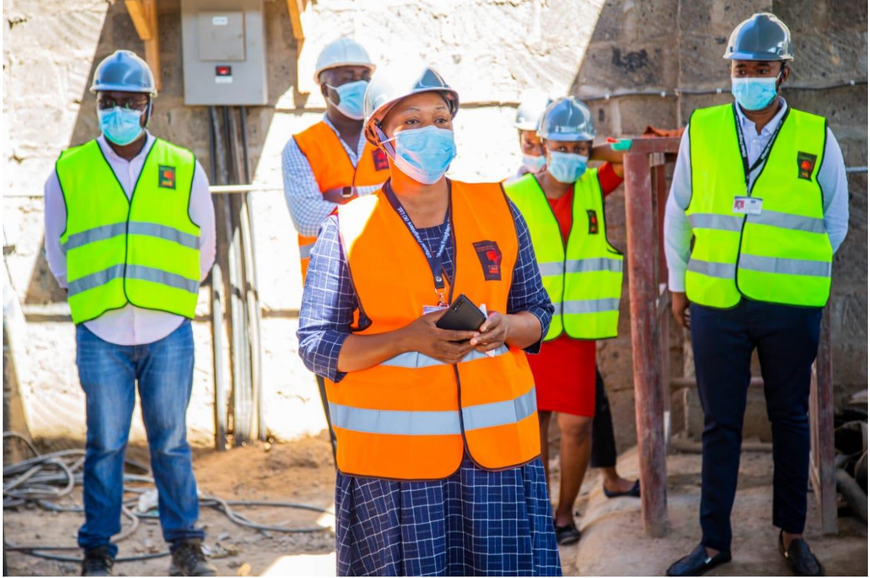
Figure 5 Staff pay attention to the ongoing Sensitization Exercise by the Public Health Official