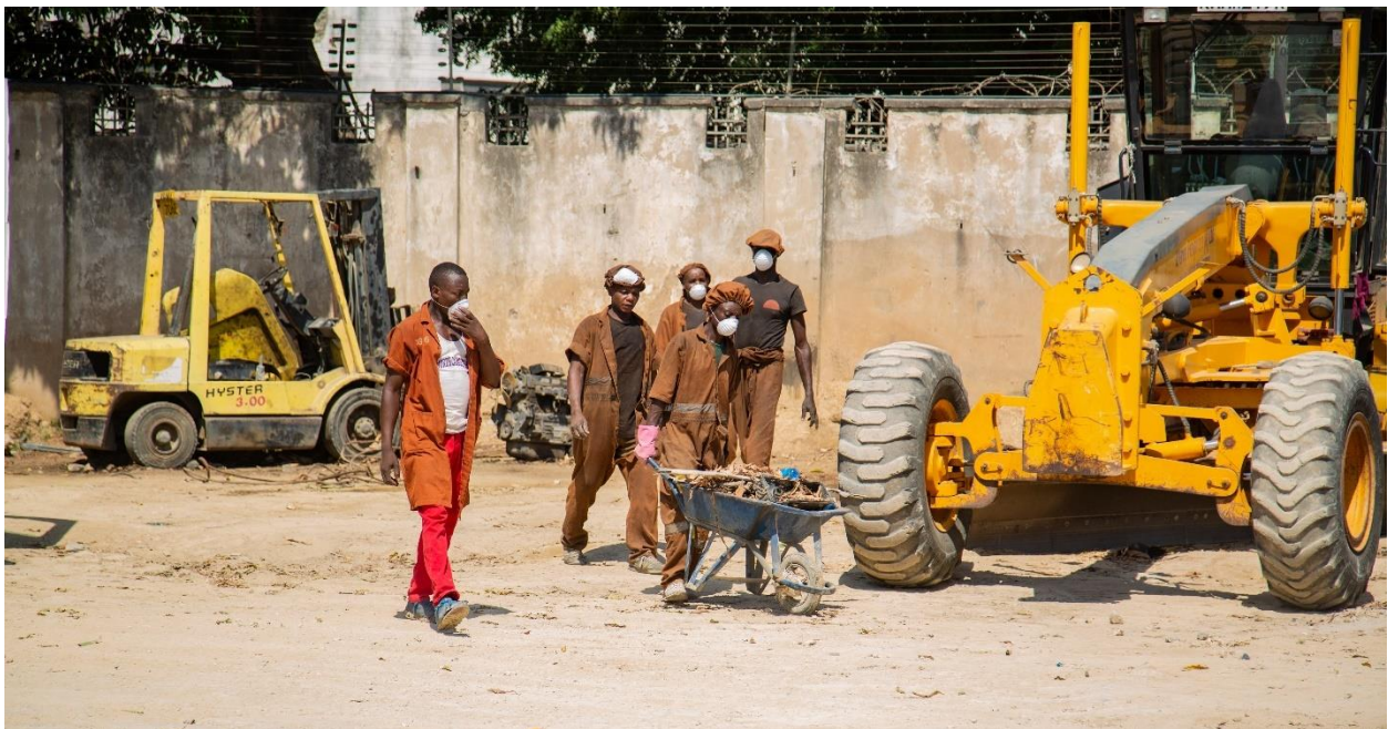
Figure 8 A group of our casual staff assist in cleaning the inside of our yard as part of the Clean-Up Exercise