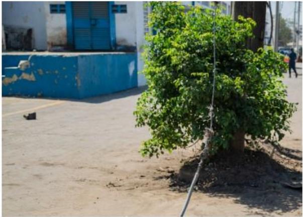
Figure 12 Sections of the street before and after the Clean-Up