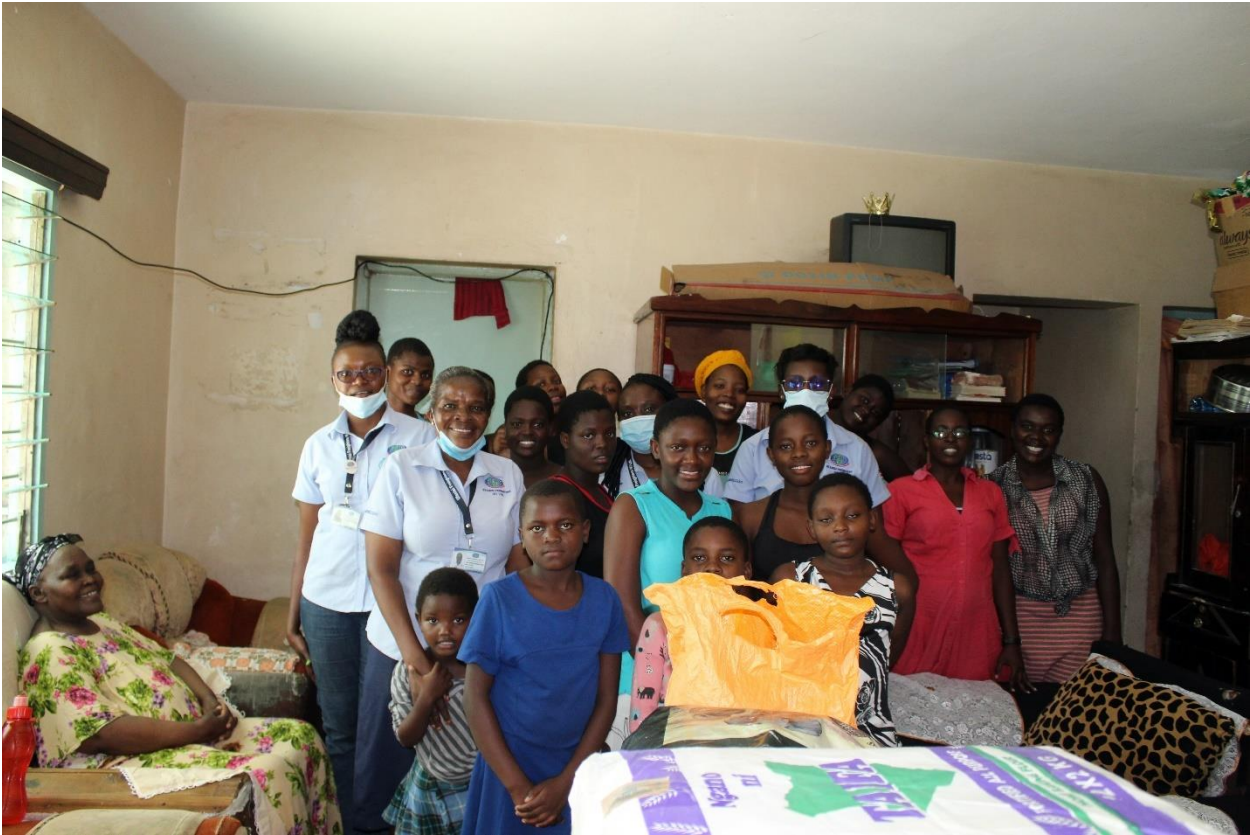
Figure 2 Staff take a picture with the children at one of the children's homes we visited during the 2020 Customer Service Week celebrations

donate food items, items of clothing, and monetary contributions to alleviate the effects of the harsh economic times made even worse by the onset of the pandemic.