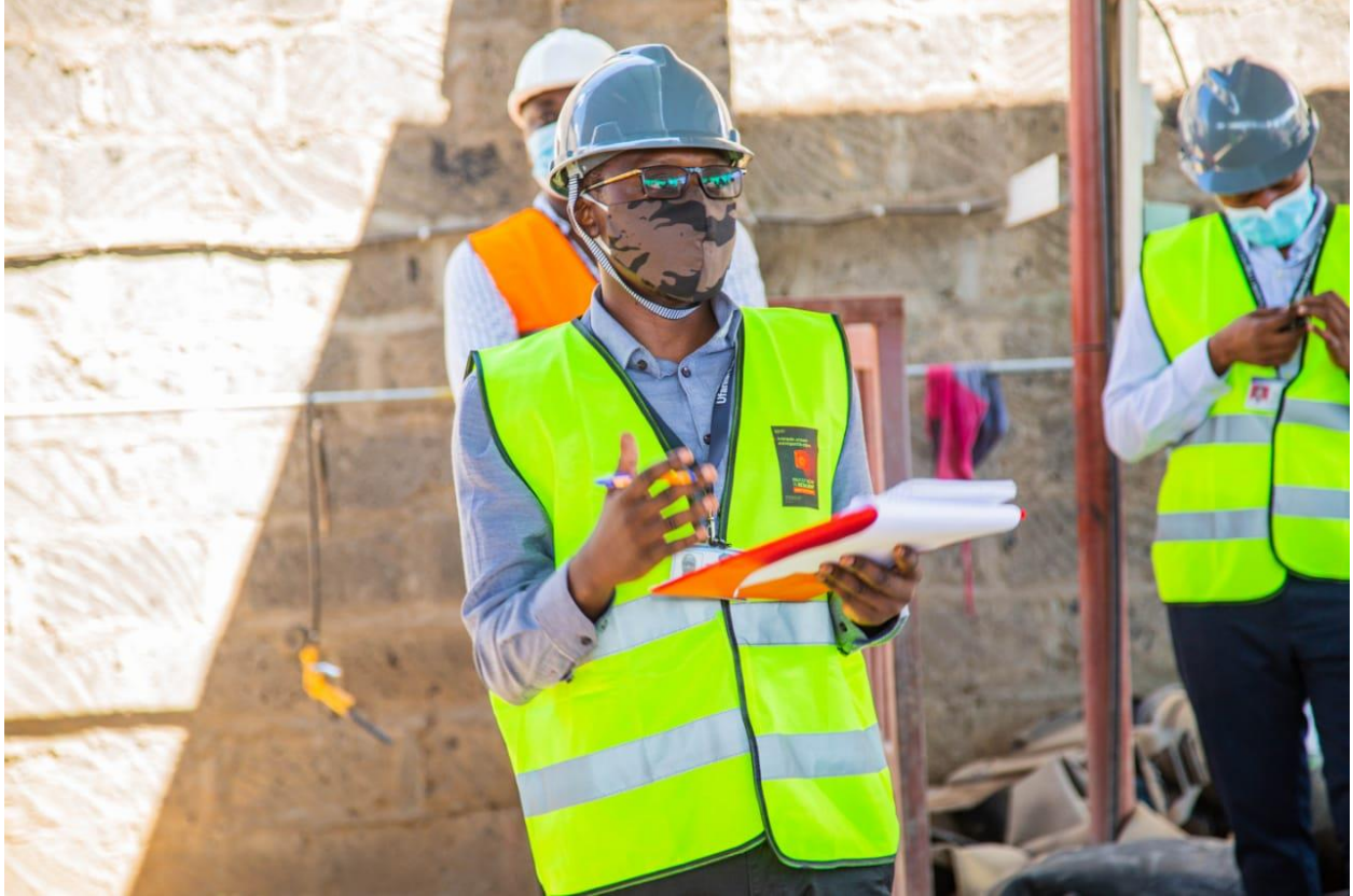
Figure 4 A staff member sensitizes staff on the importance of the World Health and Safety Day