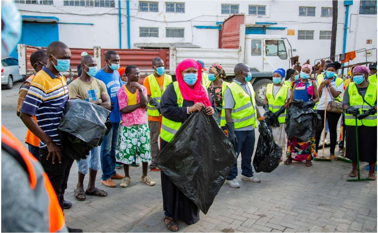
Figure 10 A Public Health Official demonstrates how to categorize the different waste into different colored bin liners