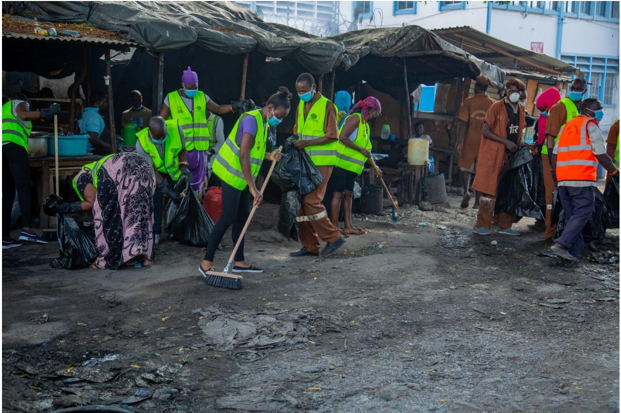
Figure 9 A combination of our staff, the occupants of the informal eating establishments, as well as the Community Health Volunteers clean up a section of the street