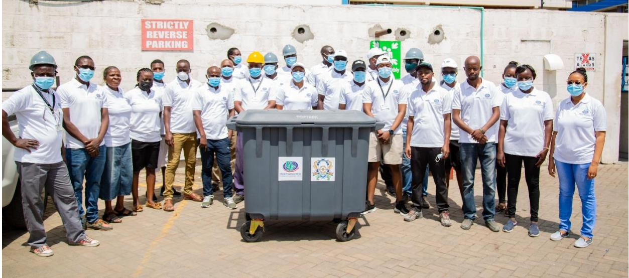
Figure 7 Staff pose next to 1 of the bins we donated during the Clean-Up Exercise