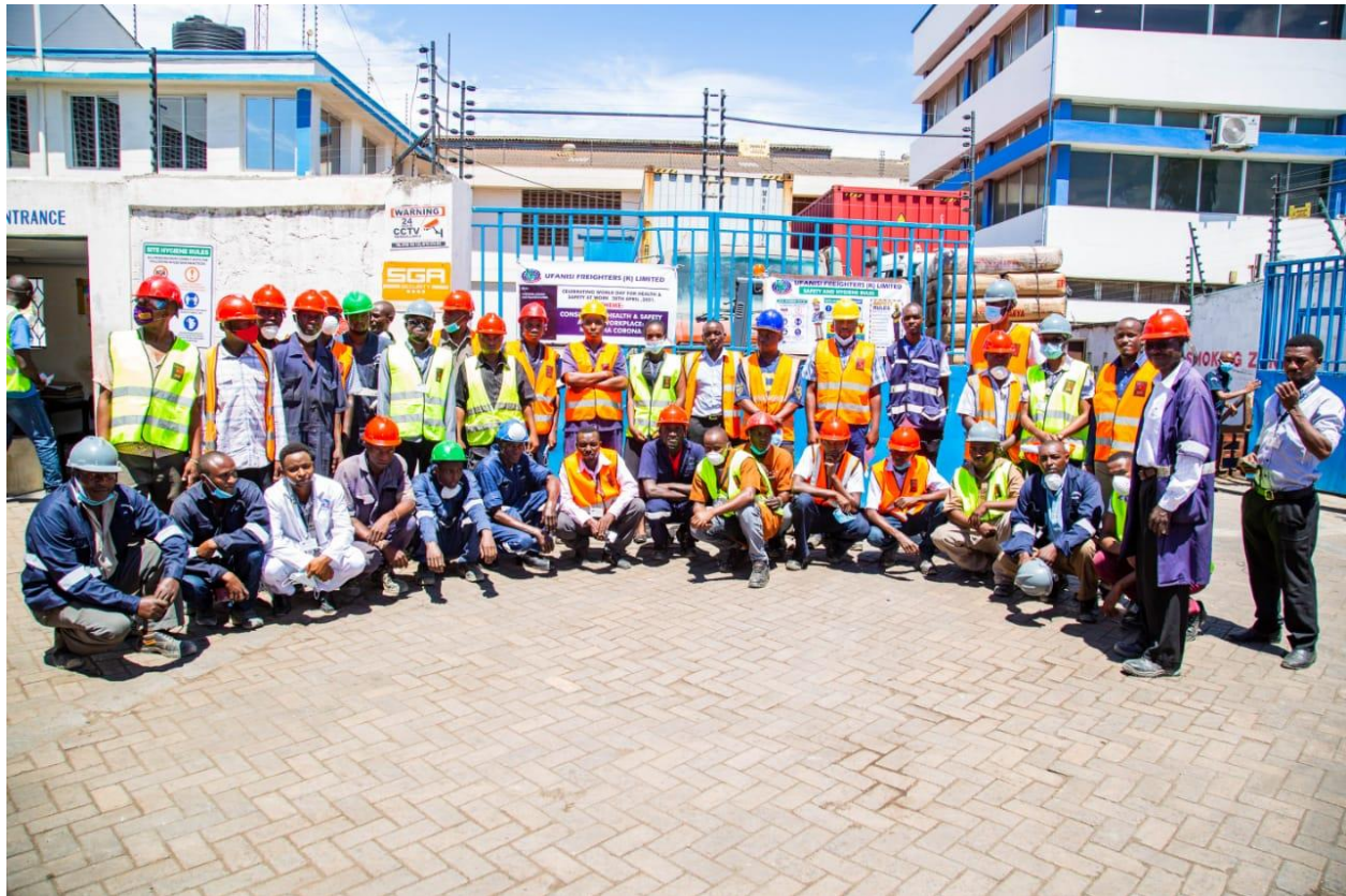
Figure 6 Staff pose for a group photo after the World Health and Safety Day activities

Besides the commemoration of the above event, all UFKL food handlers (i.e., the ones in charge of tea handling) receive the Tybbar TCV Vaccine at the point of hiring to protect them against communicable diseases e.g., tuberculosis, salmonella, E. Coli, and many others. They are also subjected to stool and urine tests every 6 months, and to a hand swab annually, so as to test for any other diseases that they may have contracted.